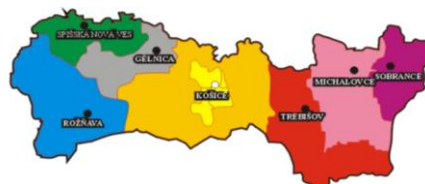
Kosice self-governing region map

Two pilot study visits have been scheduled in the first half year of OCOPOMO, one in the Kosice Self-governing Region (KSR, Slovakia) and the other one in Campania (Italy).