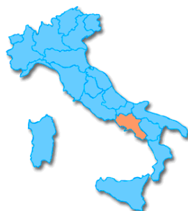
Campania Region and Italy map

The online presence of OCOPOMO-Open Collaboration for policy modelling has grown significantly over the last three months, particularly into relevant social networks. To date, OCOPOMO has established a facebook group, a blog and a LinkedIn group. Such groups aim at sharing information on open collaboration in policy modelling, particularly in relation to OCOPOMO project development with